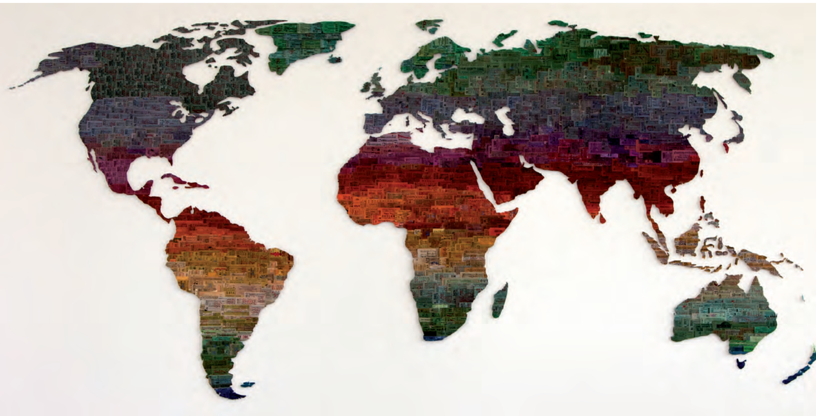
MEMENTO Recycled paper travel tickets, 220 x 110 cm ©Susan Stockwell 2012