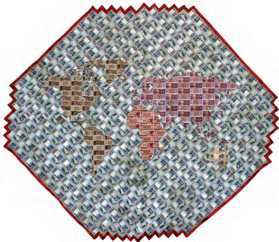
A CHINESE DREAM Chinese money quilt sewn with ribbon border, 350 cm Collection of the Victoria and Albert Museum, London