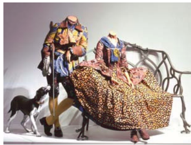
Figure 12. Yinka Shonibare, Mr and Mrs Andrews Without Their Heads (1998). Wax-print cotton costumes on armatures, dog, mannequin, bench, gun, 165 x 570 x 254 cm. © the artist. Courtesy of the artist and Stephen Friedman Gallery, London.