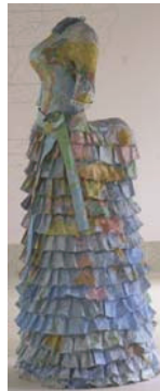
Figure 18. Susan Stockwell, Colonial Dress (2008).