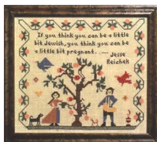
Figure 8. Elaine Reichek, Untitled (Jesse Reichek) (1994). Hand embroidery on linen. 28.6 x 31.8 cm.