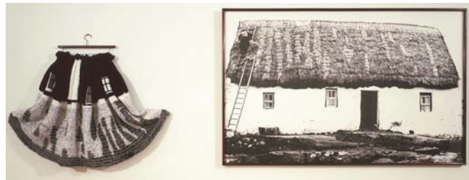
Figure 2. Elaine Reichek, Whitewash (Galway Cottage) (1992-93). Knitted wool yarn, hanger and gelatin silver print. Overall dimensions 114.3 x 337.8 cm.