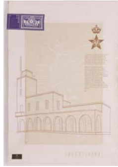
Figure 22. Studio Formafantasma, Moulding Tradition: Colony (Addis Ababa) (2011). Mohair, cotton, ceramic tiles. 230 x 120 cm.