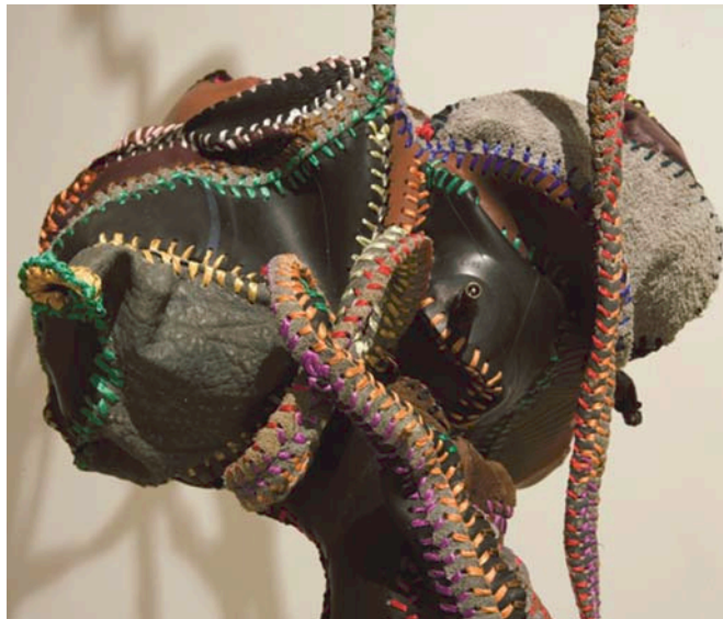
Figure 21. Nicholas Hlobo, Ingubo Yesizwe (2008), detail. Leather, rubber, gauze, ribbon, and steel. 150 x 260 cm x 3 m.