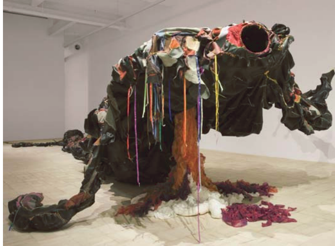
Figure 20. Nicholas Hlobo, Ingubo Yesizwe (2008). Leather, rubber, gauze, ribbon, and steel. 150 x 260 cm x 3 m. © Nicholas Hlobo.