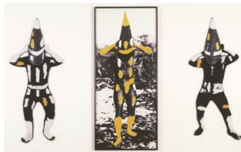
Figure 3. Elaine Reichek, Yellow Man (1986). Knitted wool yarn and hand-painted gelatin silver print. Overall 180.3 x 292.1 cm.