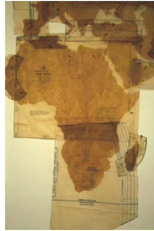
Figure 16. Susan Stockwell, Pattern of the World (2000). Paper, dress making patterns, tea. 180 x 120 x 2 cm.