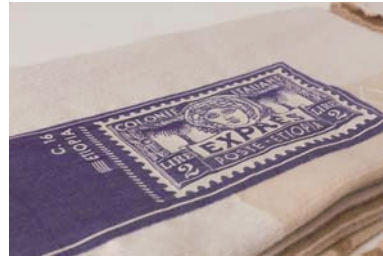
Figure 25. Studio Formafantasma, Moulding Tradition: Colony (2011), detail. Mohair, cotton, ceramic tiles.