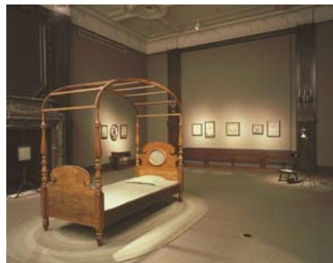
Figure 6. Elaine Reichek, A Postcolonial Kinderhood (1994). Installation view, The Jewish Museum, New York.