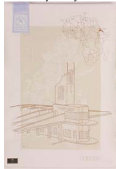
Figure 23. Studio Formafantasma, Moulding Tradition: Colony (Asmara) (2011).