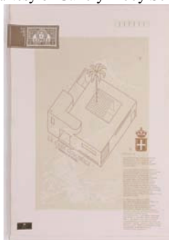
Figure 24. Studio Formafantasma, Moulding Tradition: Colony (Tripoli) (2011).