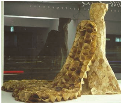
Figure 17. Susan Stockwell, Trayne (1998). Coffee filters, coffee, paper portion cups, cotton thread. Image courtesy of the artist. © Susan Stockwell.