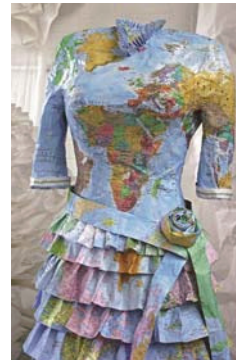
Figure 19. Susan Stockwell, Colonial Dress (2008), detail. Maps, wire, glue.