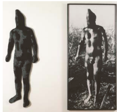
Figure 5. Elaine Reichek, Gray Man (1989). Knitted wool yarn and gelatin silver print. Overall 165.1 x 180.3 cm.