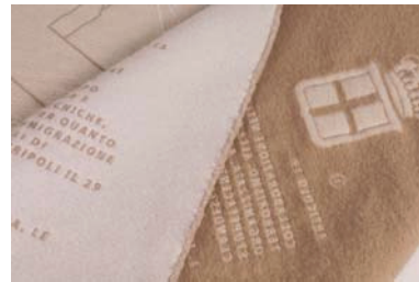
Figure 26. Studio Formafantasma, Moulding Tradition: Colony (2011), detail. Mohair, cotton, ceramic tiles.