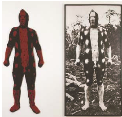
Figure 4. Elaine Reichek, Red Man (1988). Knitted wool yarn and gelatin silver print. Overall 165.1 x 177.8 cm.