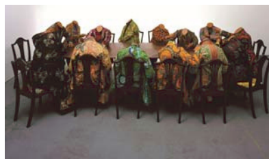
Figure 13. Yinka Shonibare, Scramble for Africa (2003). 14 figures, 14 chairs, table, Dutch wax printed cotton textile. Overall: 132 x 488 x 280cm.