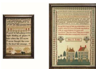
Figure 9. Elaine Reichek, Untitled (E.R.) (1993). Hand embroidery on linen. 33 x 21.6 cm.