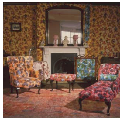
Figure 10. Yinka Shonibare, Victorian Philanthropist's Parlour (1996–97). Reproduction furniture, fire screen, carpet, props, Dutch wax printed cotton textile. Approx. 2.60 x 4.88 x 5.30m.