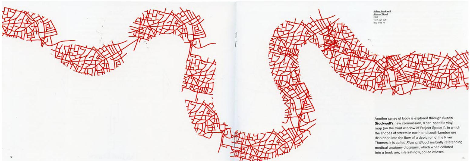
Susan Stockwell, River of Blood 2009 vinyl cut-out 3.73 x 6.5 m

Another sense of body is explored through Susan Stockwell's new commission, a site-specific vinyl map (on the front window of Project Space 1), in which the shapes of streets in north and south London are displaced into the flow of a depiction of the River Thames. It is called River of Blood , instantly referencing medical anatomy diagrams, which when collated into a book are, interestingly, called atlases .